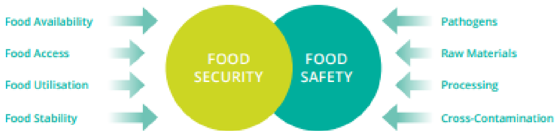
Figure 3.5.3 - Food security and food safety

Figure 3.5.3 presents the interrelation between food security and food safety concepts, as well as their main constituent elements. This section and the next will address the challenges related to food security and food safety from an ECS perspective.